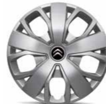
16" WHEEL TRIMS Tyres: 215/75 R16 C 35 Heavy Panel Vans