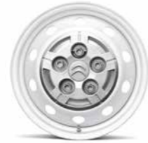
STANDARD STEEL WHEELS Tyres: 215/70 R15 C 30,33,35 Panel & Crew Vans