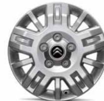
15" ALLOY WHEELS Tyres: 215/70 R15 C 30,33,35 Panel Vans