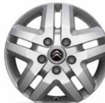
16" ALLOY WHEELS Tyres: 215/75 R16 C 35 Heavy Panel Vans