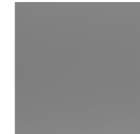
Cumulus Grey (M)