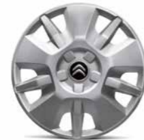
15" WHEEL TRIMS Tyres: 215/70 R15 C 30,33,35 Panel Vans